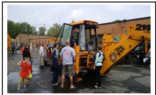
Approximately 300 children and residents visited the Town Highway Garage on the Saturday prior to National Public Works Week