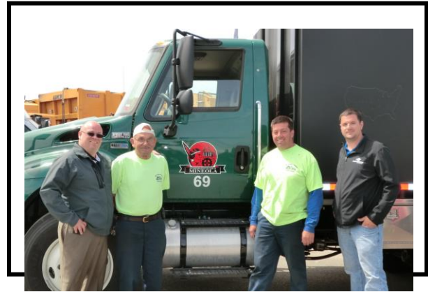
Village of Mineola Public Works staff gather around their vehicle displayed at the Equipment Show