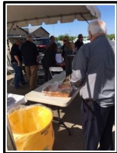
The registration desk included a continental breakfast