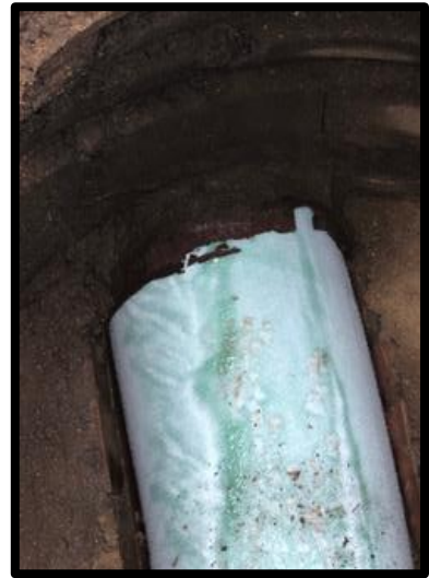
Finished product to be trimmed