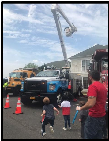
Consolidated Edison Utility Truck for overhead cable operations

The Village of Rye Brook annual truck show was hosted at Bellefair Bright Horizons Daycare and Preschool. This year the show was held during Public Works Week on May 23, 2019. Utility operator Con Edison Company of New York and Anthony Bulfamante Landscaping graciously sent trucks to expand the types of vehicles present. A total of 60 children climbed over various pieces of equipment such as a John Deere 624 Loader, Freightliner 108 crew cab, John Deere Gator ATV and more.