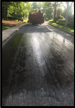
Process immediately after placement of Fibermat

The Village of Rye Brook is installing an economical surface treatment called Fibermat with a double layer of Micro surface on Village Roads. The low-cost pavement treatment will extend the service life of the roads at a fraction of the cost of milling and resurfacing. Some benefits of such treatment are suppression of cracks, a new driving surface, less disruption to traffic during installation and increased PCI road rating. The Village is treating approximately 3.5 miles of roads in the Bellefair Development with hopes of expanding this program to other streets.