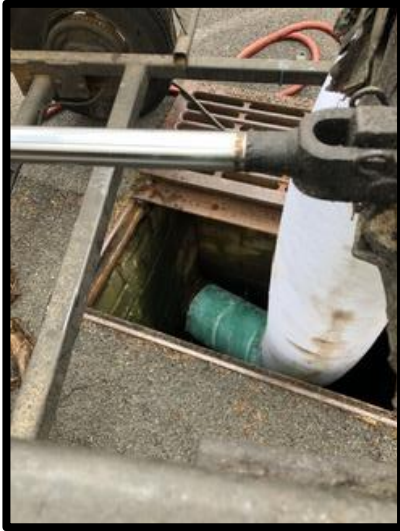
Liner during insertion, expansion and heating process

The Town of Mount Pleasant Highway initiated a pilot project this Spring lining several hundred feet of stormwater drainage conveyance piping. The lining project, expected to last years, replaces the need for the time consuming and costly process of excavating, demolishing damaged pipe, installing new pipe, and pavement replacement.