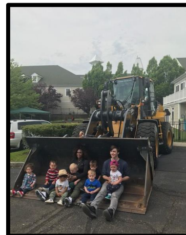
Children always want their photo taken in the loader bucket