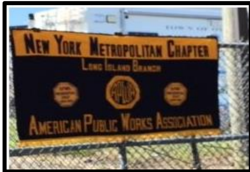
Many thanks to the Town of Oyster Bay and the Long Island Branch for hosting and organizing this year's show