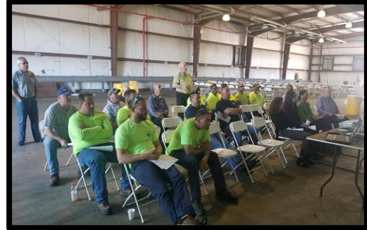
Public Works and Highway Department staff listen attentively to presentation